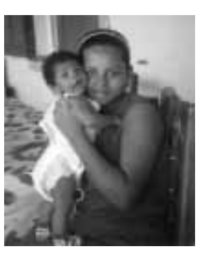
NEW BORN BABY AT CASA JIMMY

On the 31st January 2001, 16 children, 3 pregnant girls and 2 mothers with their babies were being cared for at Casa Jimmy. On its second anniversary almost 200 children and adolescents and their babies have been cared for at Casa Jimmy, most of whom have been reunited with their families.