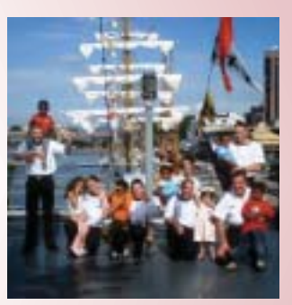
Le Eithne, CJ children, volunteers and crew

✓ On 16th March the Irish ship LE Eithne arrived in Rio - the first Irish Naval ship to visit Rio de Janeiro and go into the Southern Hemisphere. The crew organised a party for our children on board and the sailors also offered their help at Casa Jimmy and Epsom College Farm the following day.