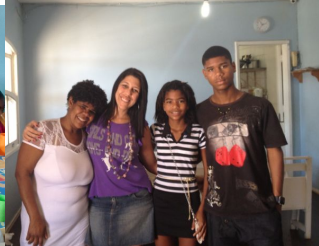
A Stepping Stones Project beneficiary at Casa Jimmy