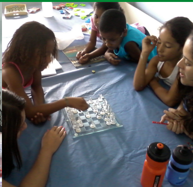
Have a look at just a few of the activities going on at Casa Jimmy!