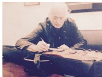
JIMMY PAGE signing the guitar.